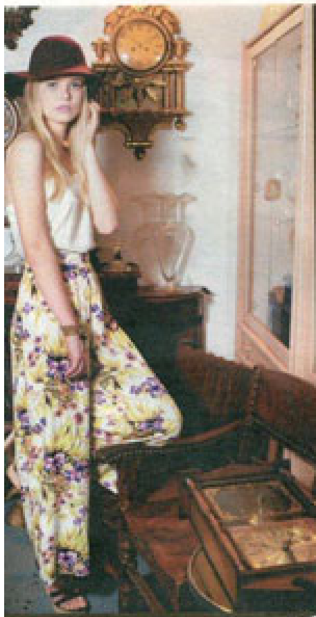
Clementine singlet, $129, New pants, $79, and Old Friend belt from Hello Friend Boutique 5607 cross beads, $29.99 each, from que

See more fashions in our photo gallery at www.goldcoast.com.au